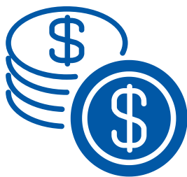
COST OF ATTENDANCE

FORMULA CHANGEWILL MEAN MORE PELL FOR SOME STUDENTS