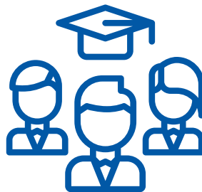
STUDENT AID INDEX